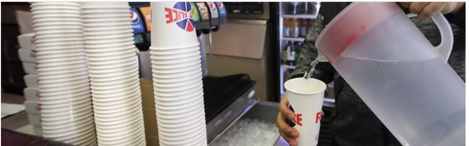
Berkeley's fee on disposable cups is part of an effort to eliminate restaurant waste.